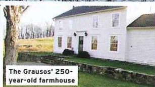
The Grausos' 250-year-old farmhouse