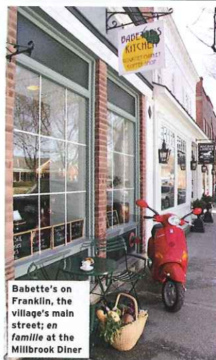
Babbette's on Franklin, the village's main street; en famille at the Millbrook Diner