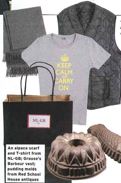
The redcoats are coming! A local rider